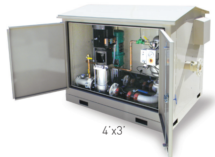
4' x 3'