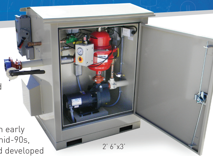
2' 6" x 3'