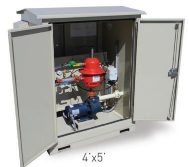
4' x 5'