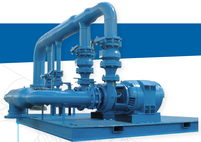
Municipal Water Treatment Ute Water Conservation District Grand Junction, CO