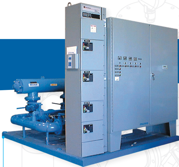
Turf Irrigation Valley View Subdivision Denver, CO