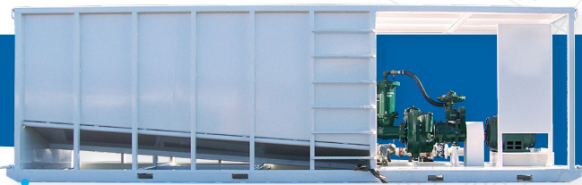
Dewatering with Fine Particulate Signal Peak Coal Mine Central Region, MT