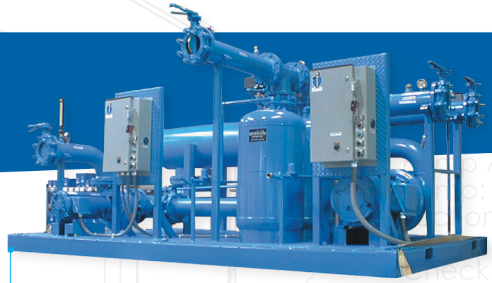
Turf Irrigation HongKou Stadium Shanghai, China