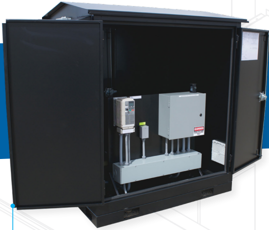
Turf Irrigation Arlington National Cemetery Arlington, VA