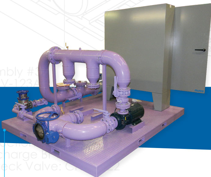
Turf irrigation with Reclamation Water Tucson, AZ