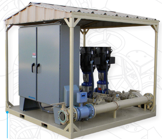
Turf Irrigation Big League Dreams Park Perris Valley, CA

With Munro Remote Monitoring, there is no wondering or worrying about your pump station.