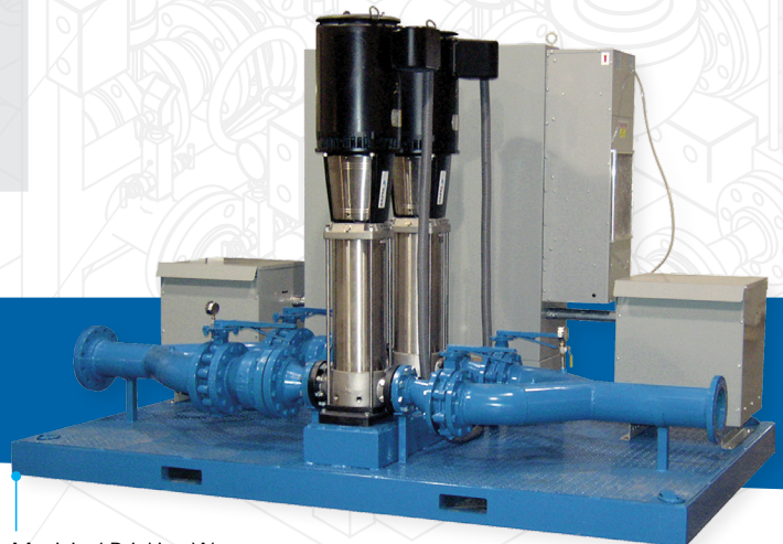
Municipal Drinking Water Buttermilk Metro District Aspen, CO