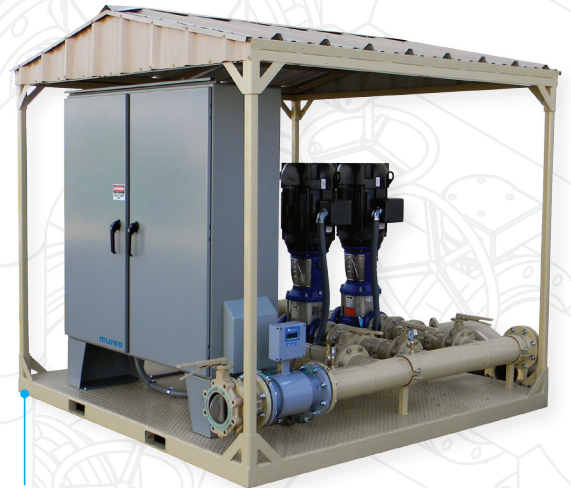
Turf Irrigation Big League Dreams Park Perris Valley, CA

Serviced – Our in-house troubleshooting team, along with our network of Authorized Service Providers (ASPs), supports our products throughout their lifecycle.