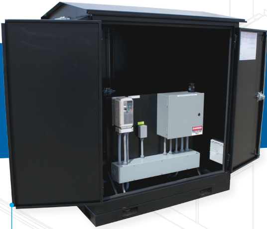
Turf Irrigation Arlington National Cemetery Arlington, VA