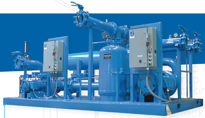
Turf Irrigation HongKou Stadium Shanghai, China